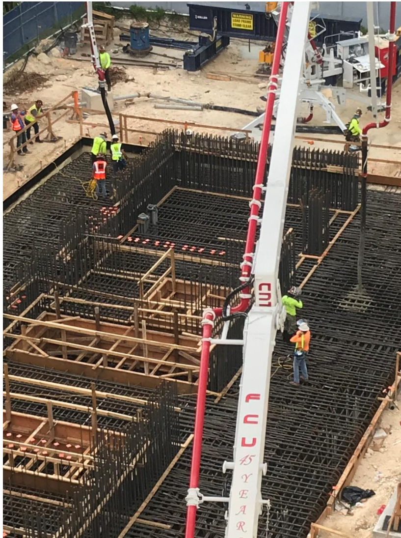
YOTELPAD MIAMI, BEFORE THE POUR

The 31-storey YOTELPAD Miami by Aria Development Group , AQARAT , and Stantec will be the first of its kind on the East Coast. Thus setting a new standard for the line, the Miami location will be a first in more ways than one.