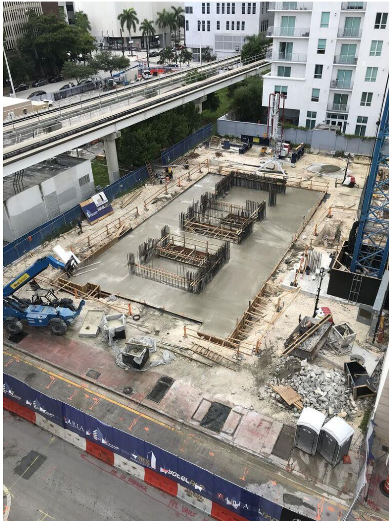
YOTELPAD Miami, cement pour complete

Located downtown, at the corner of NE 2nd St and NE 2nd Ave, YOTELPAD Miami will place guests and residents within the heart of the city, close to all of the most popular restaurants, clubs, and shopping that the city has to offer. The project will also be close to the waterfront, Metromover, and Bayfront Park.